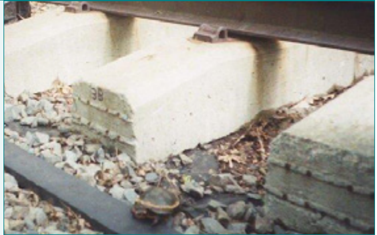
A turtle uses a critter tunnel to pass beneath the Greenbush Line tracks. South Coast Rail includes similar crossings to encourage wildlife passage.

Following the public review of the DEIS/DEIR, the Corps eliminated the Attleboro Alternatives and re-evaluated the Rapid Bus Alternative, examining ways to improve ridership and eliminate bottlenecks. Many modifications were developed and evaluated. (They are described in Appendix 3.1-E, Modified Rapid Bus Technical Memorandum.) Despite these efforts, the Rapid Bus Alternative continued to show lower ridership, much higher cost and greater environmental impacts than the commuter rail alternatives. The Federal Highway Administration (FHWA) concurred that the Rapid Bus Alternative would degrade service on the interstate highway system and thus was not viable. The Corps, therefore, did not evaluate the Rapid Bus Alternative in the FEIS/FEIR.